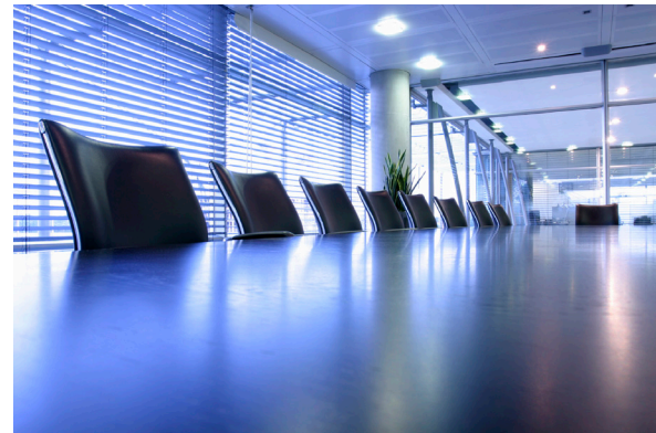
In 2009, Harris Stratex Networks ranked 175 on the InformationWeek 500 List of Top Technology Partners .

Harris Stratex serves all global markets including mobile network operators, public safety agencies, private network operators, utility and transportation companies, government agencies and broadcasters. The company has a strong and growing presence in all regions, including North America, Europe, the Middle East, Africa, Asia, the Pacific Rim and Latin America, with customers in over 135 countries. Harris Stratex Networks is also the largest supplier of microwave systems in North America and a top-tier provider of wireless infrastructure solutions worldwide.