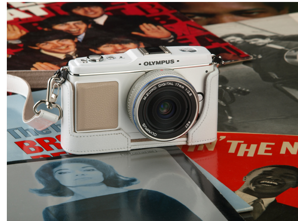
Possibly best known globally for their outstanding cameras, the Olympus E-P1 white 17mm is one of the company's latest offerings.

The Olympus Group currently owns more than 10,000 patents. For the fiscal year 2007/2008, the Olympus Corporation in Japan had 33,000 employees and sales of ¥ 1,128,875 million. With sales of € 1,733.1 million and 4,650 employees, Olympus Europe is the second largest company within this multi-corporate enterprise.